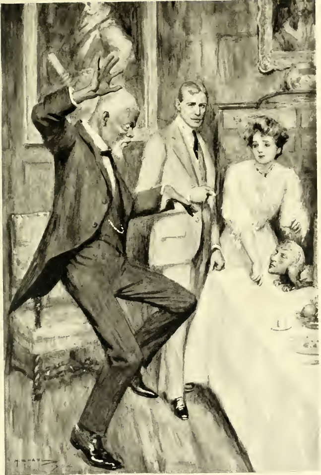
“Jeekie . . . began to execute a kind of war dance” (page 121).